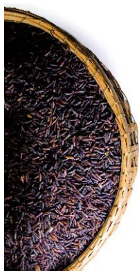
Fig.1 Riceberry grain

Riceberry a newly developed purple rice by crossing between the world-renowned white Jasmine and purple short-stature, non-photoperiod insensitive JHN purple rice (see in Fig. 1). Riceberry is set the most successful whole grain rice breeding to disrupt normal white rice eating habit. Consumers know Riceberry by distinctive appearance, nutritional value, and perception that not only fill our stomach but also fill our heart. Inducing consumers to accept the nutritional benefit of whole grains is the major change of mindset about rice consumption. The beauty of purple color and the indulgence of soft and tasty are the second mindset changing consumers understanding about the health benefit of natural pigments.