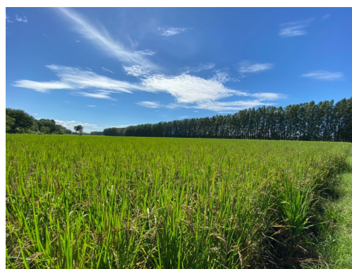
Fig.2 Organic Rice Research Farming Station, Kasetsart University, Kamphangsaeen Campus, Thailand

Developing health concern products requires not only good processing but also traceability to the original organic paddy field. Figure 2 shows the Organic Rice Research Farming Station, Kasetsart University, Kamphangsaeen Campus, Thailand. In order to expand from small to large organic field, the concept of Riceberry valley was established on 12 focus areas around the north and northeast of Thailand where the weather is permissive to high-quality rice. At present, approximately 20 000 Rai of the organic-cultivated area was registered on various types of organic certification programs including transitional, Organic Thailand, IFOAM, EU, COR, and USDA. The return to investment on farmland was estimated at 6,500 Thai Baht (THB) per Rai with an average benefit of 32 500 B/family/season (1 354 $ per hectare) [13] .